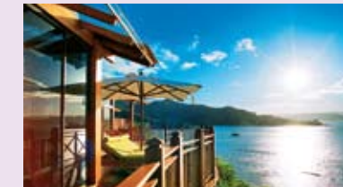
Ponta dos Ganchos, Brazil