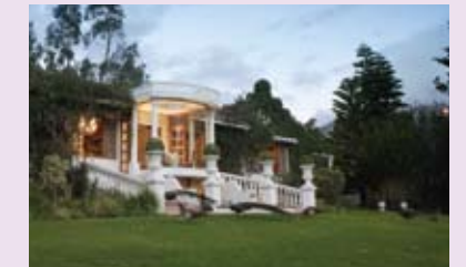
Above - La Mirage Hotel, Ecuador.