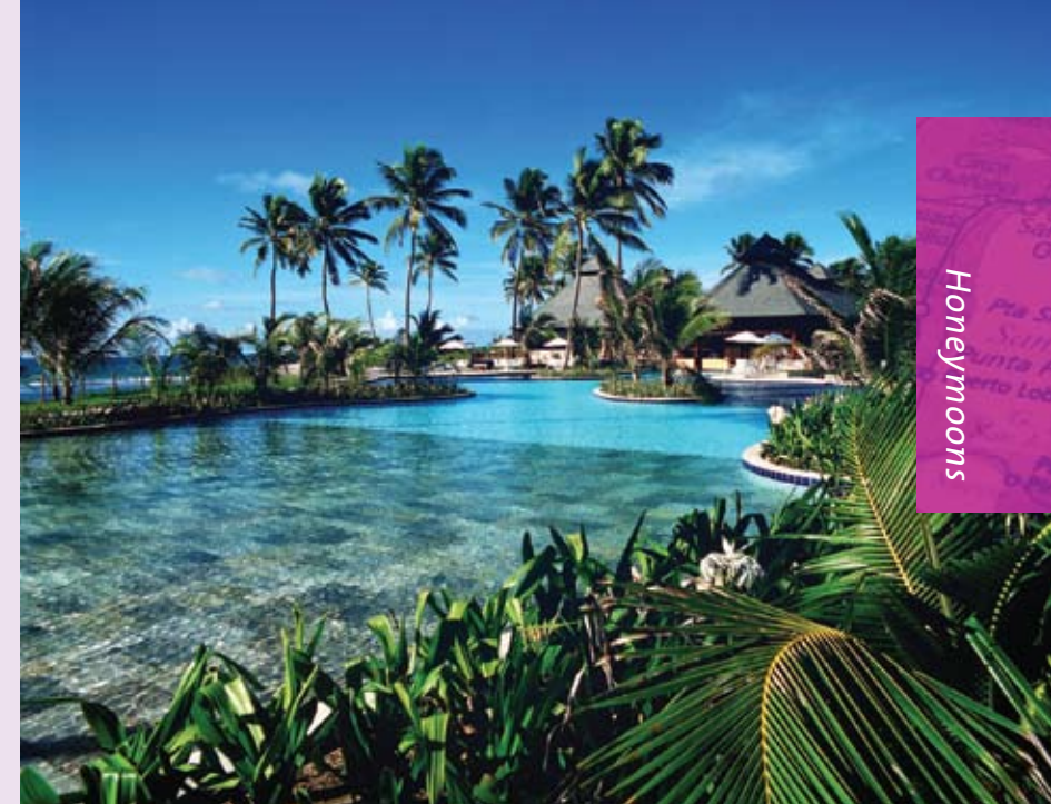
Right – Deluxe Private Bungalow, Nannai Resort